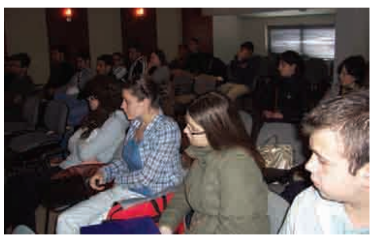
Alternative Sentence Project.

Also she highlighted the great importance that has the collaboration signed on this purpose with the Network Associations in the framework of the Memorandum signed in order to achieve better results in the implementation of